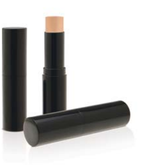
FD 0115 Foundation