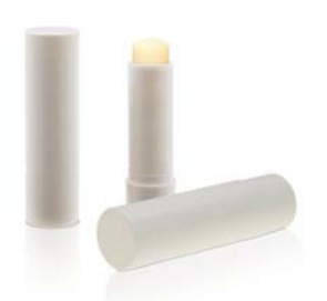
LB 5413 Lip Balm