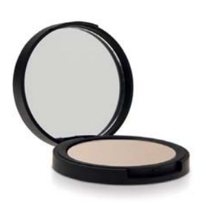
COMPACT 59 Face Powder